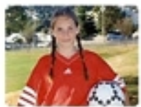
GALLERIES Shots of Amanda Knox